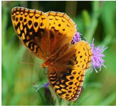
Great Spangled Fritillary