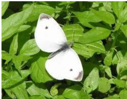
European Cabbage Butterfly